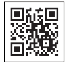
COVID-19 Vaccine Navi secondary code